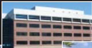
1900 ST. ANTOINE

2,396 r.s.f. - Suite 103 Leasing Contact: Melissa Bliss