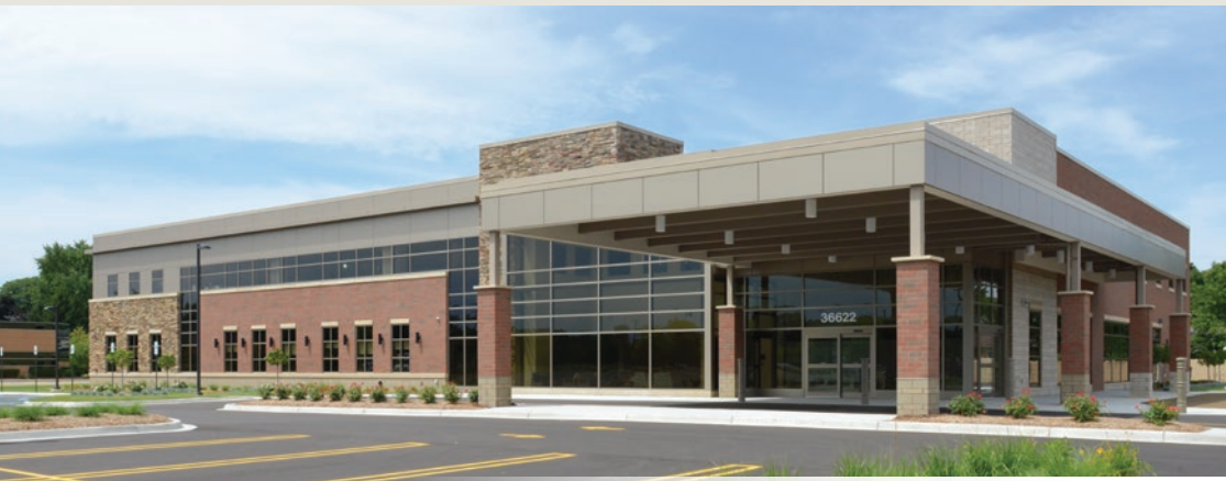
Mendelson Kornblum Medical Building, Livonia