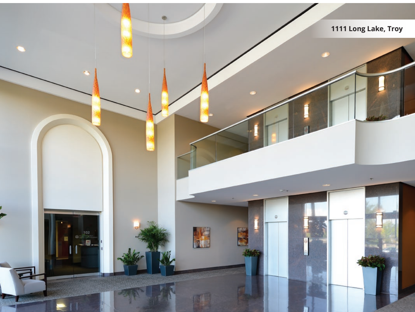
1111 Long Lake, Troy