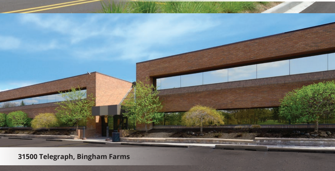
31500 Telegraph, Bingham Farms