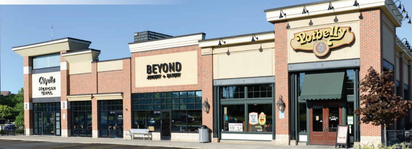
Evergreen Atrium Marketplace, Southfield

Burstein expressed enthusiasm for these initiatives, "These transactions are an important part of our building ownership strategy. Interest rates are favorable right now, which will help support long-term cash flow across our portfolio."