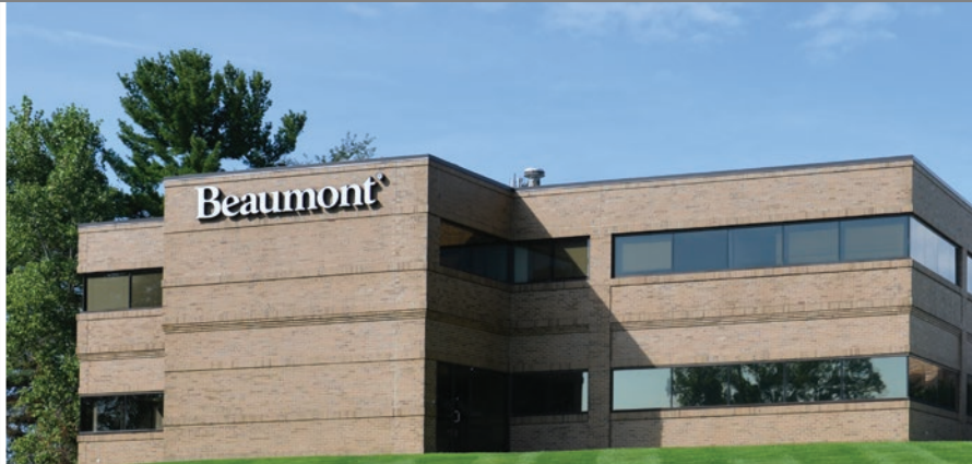
College Park, Livonia