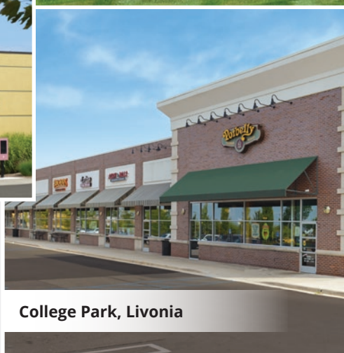
College Park, Livonia

The office building at 975 Opdyke, a maturing loan with two medium-term leases in place, was also successfully refinanced. At the College Park mixed-use campus, retail and restaurant assets were refinanced. These successful assignments foster stabilization within Etkin's portfolio, supporting the long-term value of the company's properties while also creating increased cash flow.