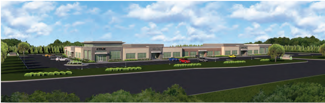
Distinctive landscaping features include a stream that winds around the north side of the property.

The current design of Victor East may be modified and built-to-suit for a major tenant. Options are available for a screened loading area with overhead doors per tenant requirements. Space may be easily divided for multiple users with each suite highlighted by a distinctive decorative entry. Clear height ceilings of 13+ feet increase options for planning along with additional corner offered by the unique U-shaped building design. High standards and finishes throughout including energy efficient lighting, HVAC system and the building envelope.